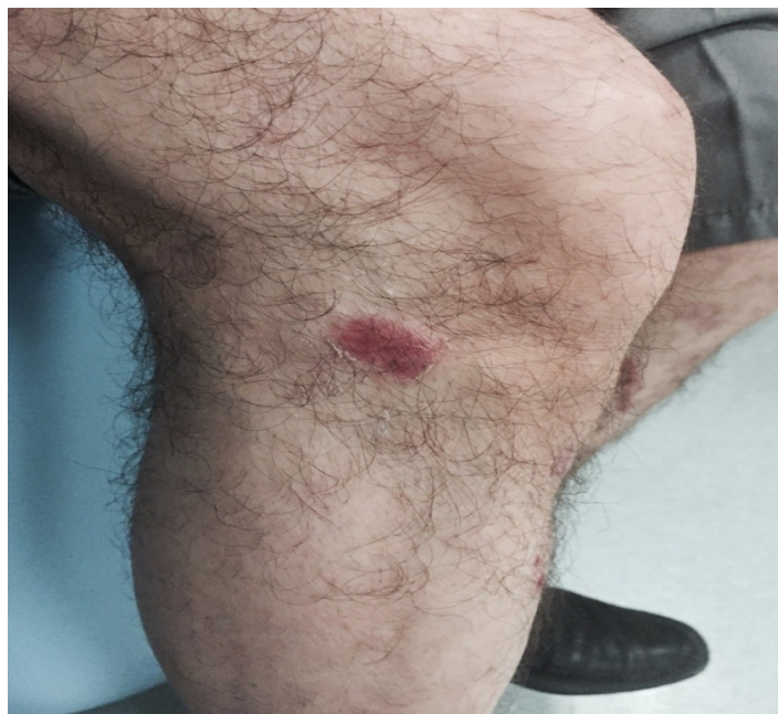
Figure 2 Skin lesion

Pemphigus vulgaris was suspected during the dermatologic examination of the patient. Skin biopsy confirmed the diagnosis of pemphigus vulgaris. 1 mg / kg / day dose methylprednisolone was started and at day 4, the patient's complaints were subsided. At 7th day, endoscopic laryngeal examination showed completely healed lesions and significant decrease of edema. Laryngeal mucosa was completely normal after 14 days. The skin lesions are topically treated with mometasone furoate and steroid therapy was terminated tapering on day 21. Erosive lesions in the nasal mucosa was observed during second month control endoscopic examination. Informed consent about steroid therapy was given by the patient. A year after initial therapy, there was no skin or laryngeal lesions.